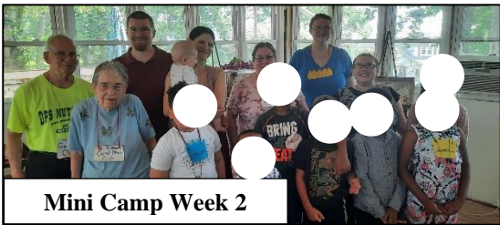
Mini Camp Week 2