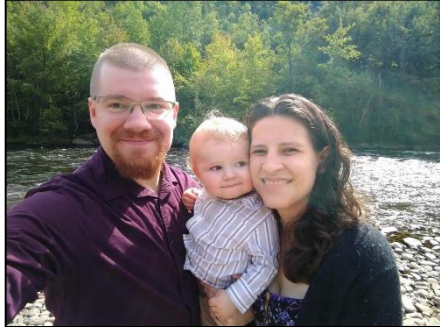
Wear Family Outing in September