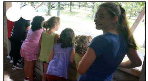
Mini Camp week 4: One of these girls exclaimed, "This is better than VBS!"