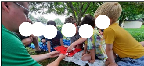
Playing Gospel Match at 5-Day Club