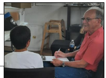
Campers are interviewed by a trained counselor.